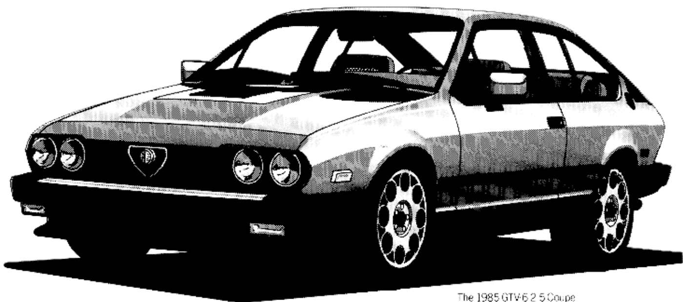
The 1985 GTV6 2.5 Coupe

For the past 75 years, Alfa Romeo has been single-mindedly pursuing only one goal: The passionate engineering of high-performance automobiles for sophisticated drivers.